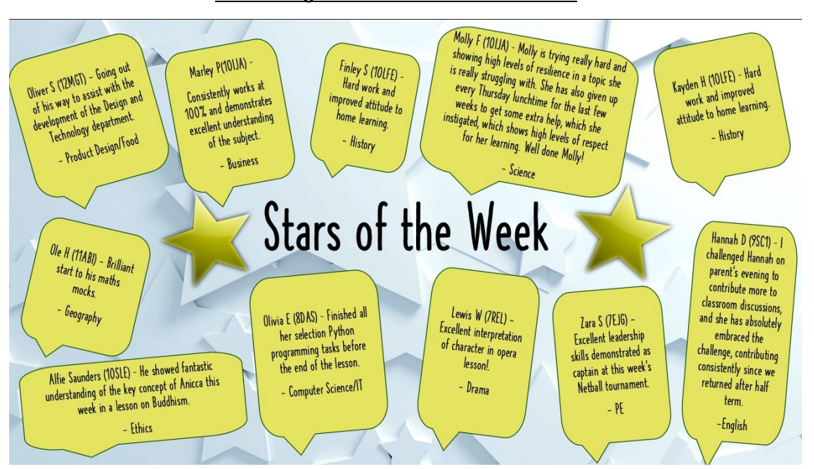
Top 10 Praise Points This Week