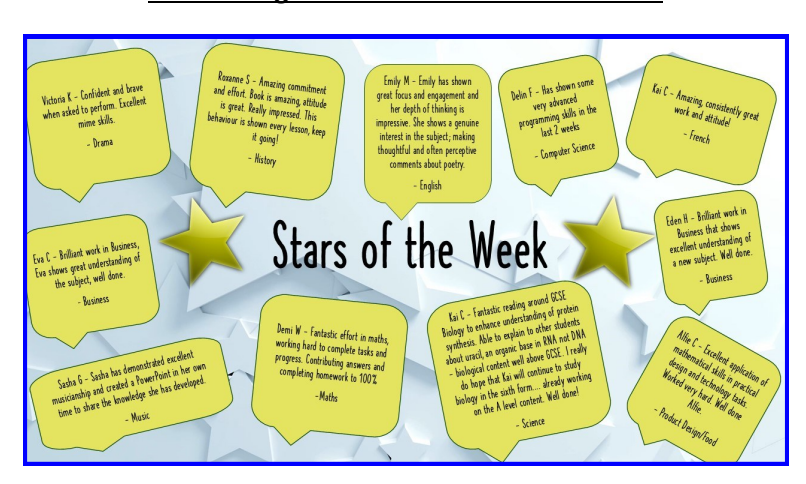
Top 10 Praise Points This Week