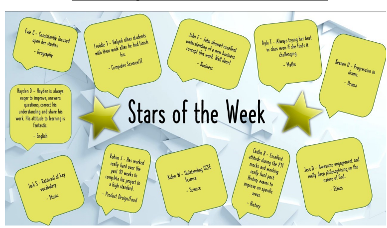
Top 10 Praise Points This Week